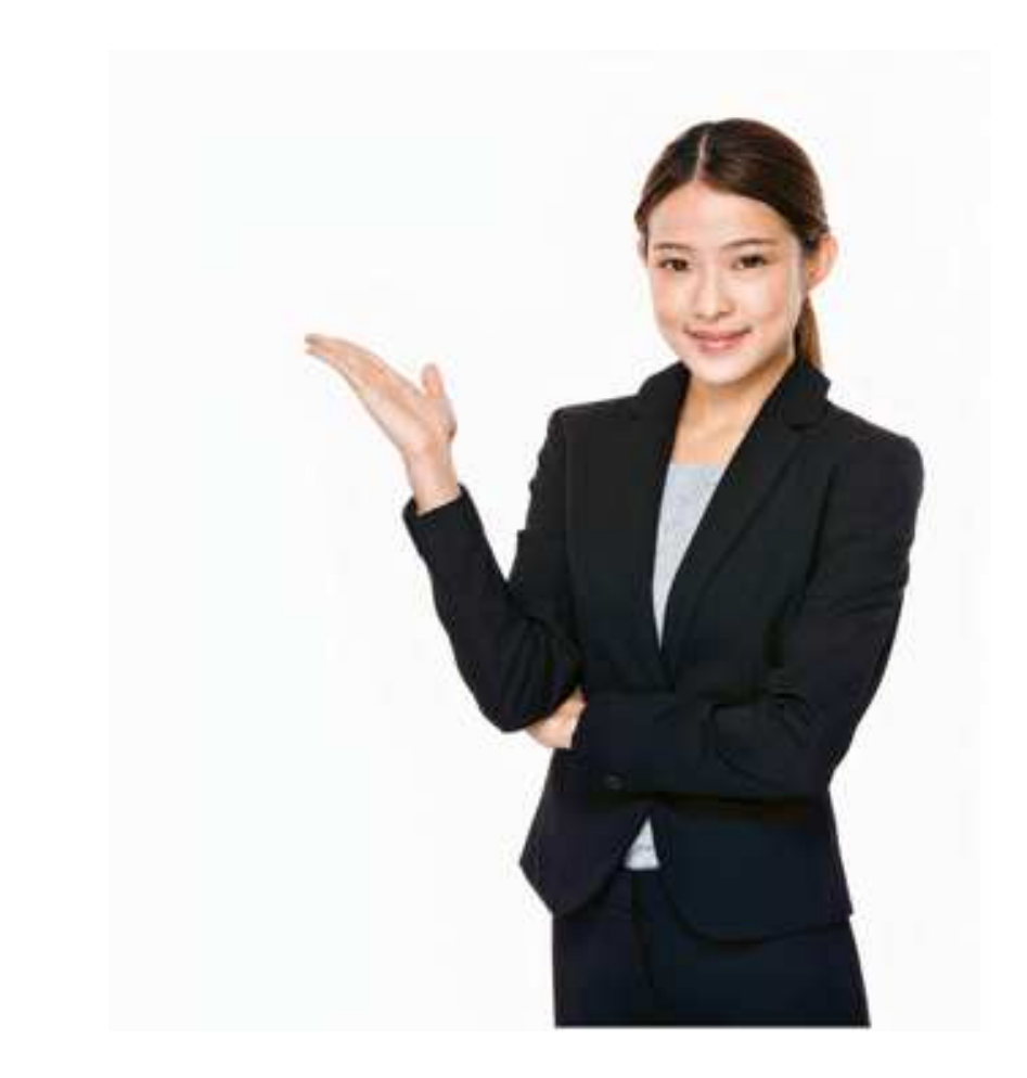
1st Month start up costs $2999

From recruiting top talent to managing operations and analysing productivity, Hyperion Business Consultants provides a smooth outsourcing experience that maximises your business's efficiency and value.